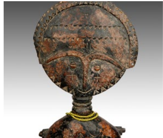
Ashanti Akuaba or Fertility Doll

Authentic African dolls, whether for play or for magic have been created and used for centuries. Among the most famous of these dolls are the Akua Ba dolls of the Ashanti people in Ghana. Ashanti carvers allow themselves free reign in interpreting traditional elements; however, true Akua Ba dolls invariably have a disc shaped head with high arched brows, a high forehead, and a straight nose. Women who are pregnant or wish to be pregnant remind themselves of the Ashanti ideal of beauty carrying Akuaba in the waistband of their skirts.